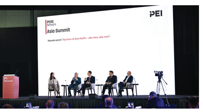
Mapletree participated in panel discussions at the PERE Asia Summit 2023.